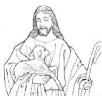
KNOWING JESUS AS THE GOOD SHEPHERD & SHARING THE RISEN CHRIST WITH ALL.