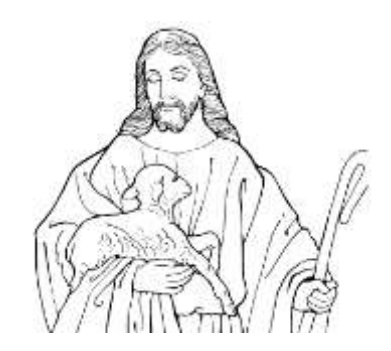
KNOWING JESUS AS THE GOOD SHEPHERD & SHARING THE RISEN CHRIST WITH ALL.