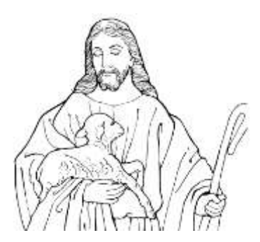
KNOWING JESUS AS THE GOOD SHEPHERD & SHARING THE RISEN CHRIST WITH ALL.