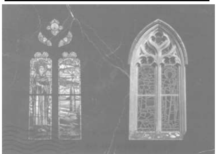
We received this postcard in the mail indicating that people in our community appreciate our Good Shepherd Window as much as we do.