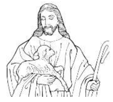
KNOWING JESUS AS THE GOOD SHEPHERD & SHARING THE RISEN CHRIST WITH ALL.