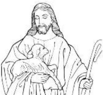
KNOWING JESUS AS THE GOOD SHEPHERD & SHARING THE RISEN CHRIST WITH ALL.