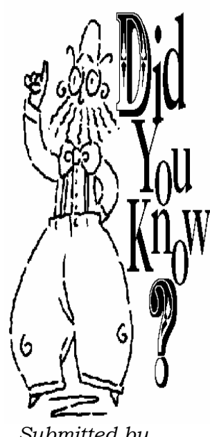
Submitted by Dean Wildrick

United Methodists rejected constitutional amendments that could have paved the way to make the church in the United States one of several regional bodies throughout the world. The United Methodist Council of Bishops announced that the 135 annual conferences defeated amendments that would have structured the U.S. church in the same manner as church re-