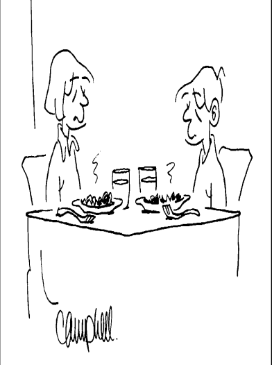
"That's the problem with a garden. The fruits of your labor are vegetables."