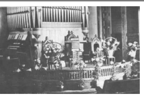
Interior of our church in 1956

Our Organ is 100 years old this month (May). It was built in 1919 by M.P. Moller Organ Company of Hagerstown, MD (which was once the largest pipe organ builder in the United States). After the Methodist church on the corner of Spring and Chapel Streets burned in February 1918, the long abandoned Universalist Church at our present location on the corner of East Main and Green Streets was purchased, extensively repaired and remodeled. The new organ was purchased for $1,750.00 and was installed in May 1919. This new home of the Methodist church was dedicated in June 1919.