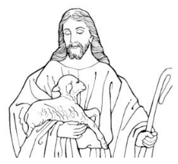
KNOWING JESUS AS THE GOOD SHEPHERD & SHARING THE RISEN CHRIST WITH ALL.