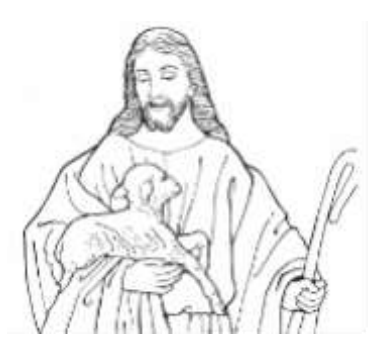
KNOWING JESUS AS THE GOOD SHEPHERD & SHARING THE RISEN CHRIST WITH ALL.