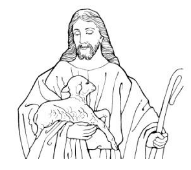
KNOWING JESUS THE GOOD SHEPHERD & SHARING THE RISEN CHRIST WITH ALL.