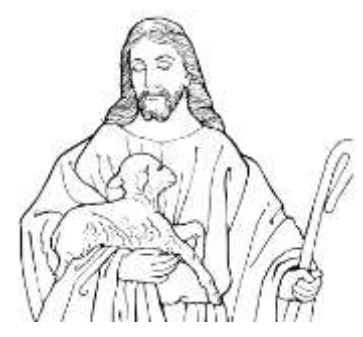
KNOWING JESUS AS THE GOOD SHEPHERD & SHARING THE RISEN CHRIST WITH ALL.