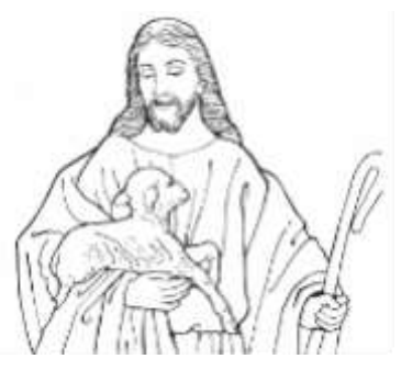
KNOWING JESUS AS THE GOOD SHEPHERD & SHARING THE RISEN CHRIST WITH ALL.