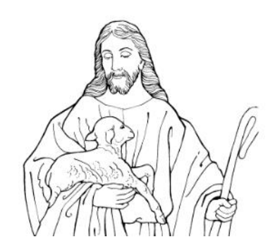
KNOWING JESUS AS THE GOOD SHEPHERD & SHARING THE RISEN CHRIST WITH ALL.