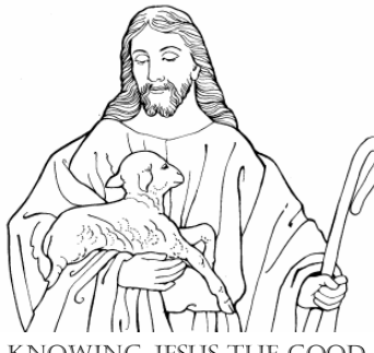
KNOWING JESUS THE GOOD SHEPHERD & SHARING THE RISEN CHRIST WITH ALL