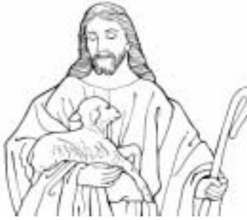
KNOWING JESUS THE GOOD SHEPHERD & SHARING THE RISEN CHRIST WITH ALL